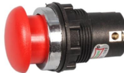
Ar-MSN Push Button