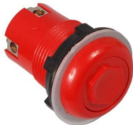
Ar-HD Push Button