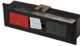
ACH DOL Push Button