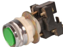
Ar-PB-2 Push Button