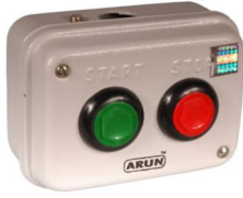
ASP-2 Push Button (Mild Steel)