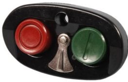
AK-1 Push Button