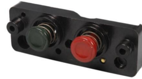
AEX Push Button