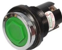
Ar-HSN Push Button