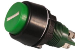
Ar-PNO Push Button