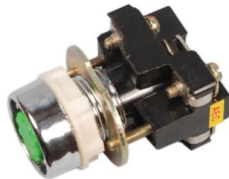
Ar-PB-5 Push Button