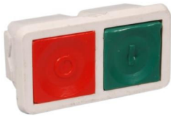
AS-1 Push Button